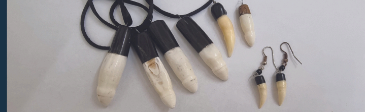
Avoid products made from jaguar teeth or claws