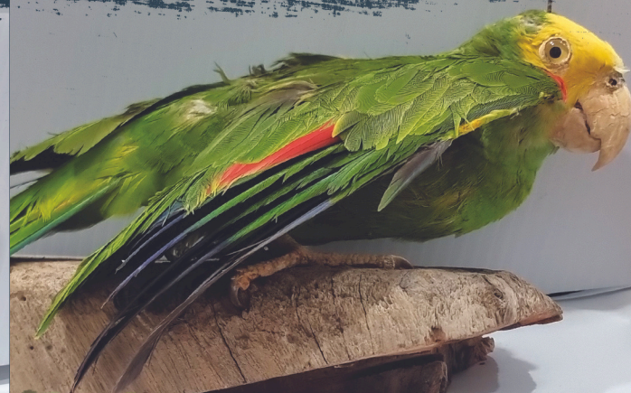
Avoid products made from birds and specific plants

In Belize, all wild bird species and their products are protected by national legislation. Do not purchase live birds, mounted birds, their eggs, nests and other parts. Although some countries may allow the importation of feathers without a permit, Belize has imposed a domestic ban on these products, therefore, purchase and export is illegal.