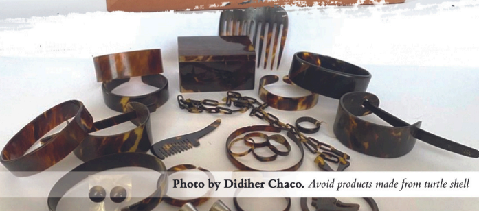
Avoid products made from turtle shell